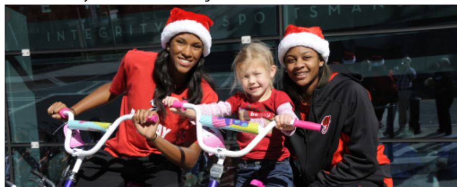
Georgia players pose with a young Lady Bulldog fan during the team's annual Bike Build.